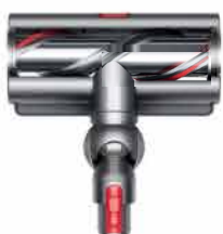
Torque drive cleaner head